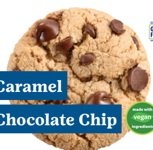
Caramel Chocolate Chip

Crisp and crunchy oatmeal cookies with creamy peanut butter filling