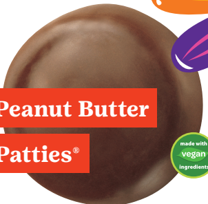
Peanut Butter Patties®

Crispy chocolate wafers dipped in a mint chocolaty coating