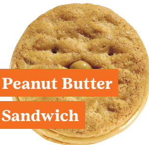
Peanut Butter Sandwich

Crispy cookies topped with caramel, toasted coconut, and chocolaty stripes